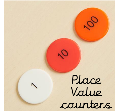
Place Value counters